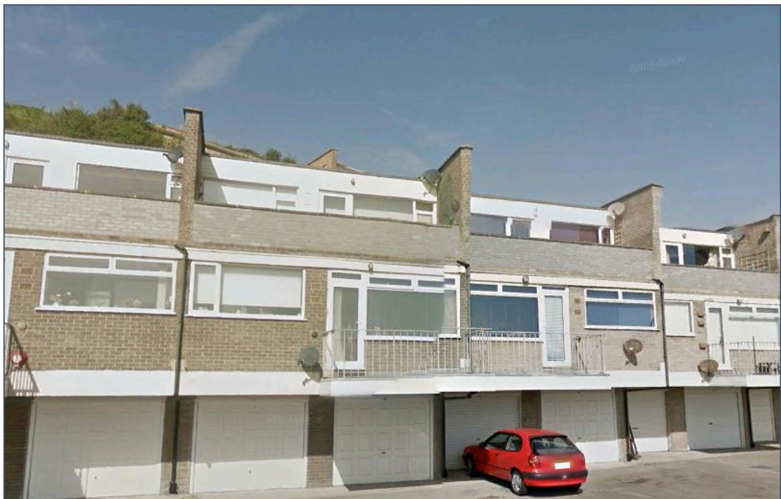
Photograph 7 Modern housing abutting Newhaven Fort