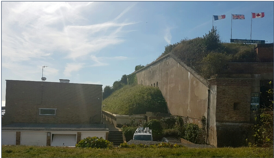
Photograph 6 Modern housing abutting Newhaven Fort