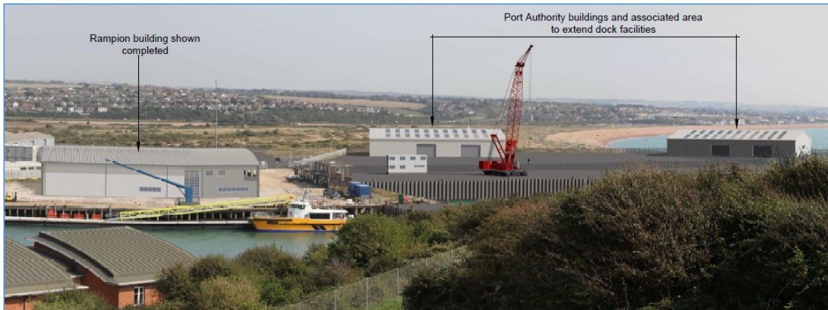
Photograph 3 Baseline view of PDA from Newhaven Fort with permitted buildings constructed