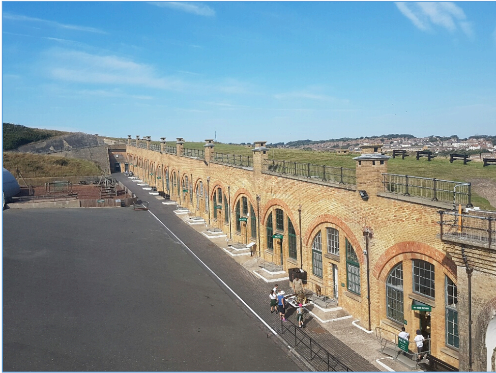
Photograph 1 Newhaven Fort