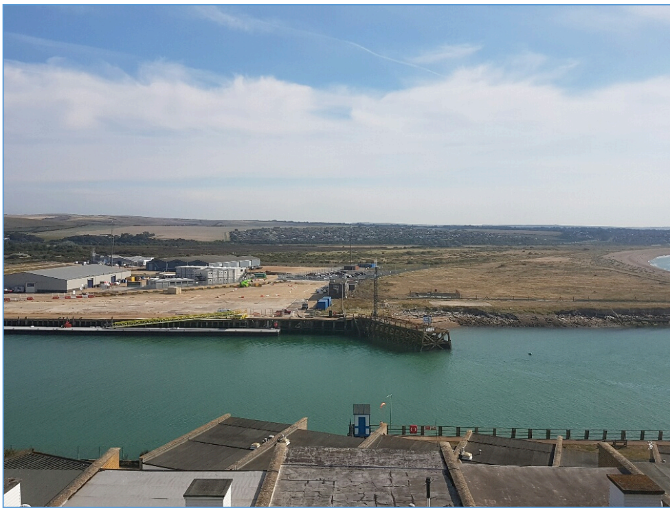
Photograph 2 View of PDA from Newhaven Fort (March 2017)